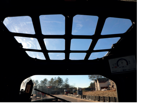
Comfort Better visibility

Easily connect your existing attachments (for added speed, consider adding the Power-A-Tach<sup>™</sup> mounting system.)