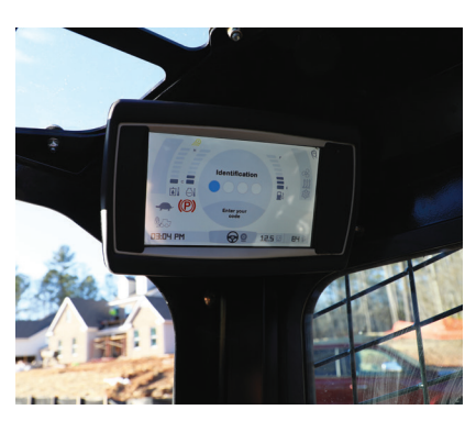
New display Intuitive use