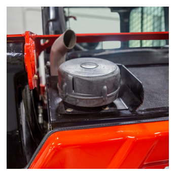
Pre-cleaner Reduce engine wear and TCO in dusty environments by adding an engine pre-cleaner.