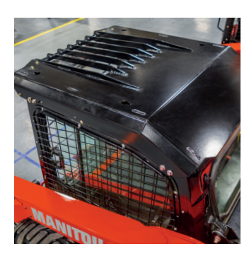
FOPS Level 2 For the users that need level 2 FOPS an optional level 2 heavy duty bracket delivers the protection they need. Bracket also protect the front LED work lights.