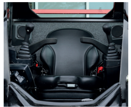
Joystick Ergonomics and precision for easy handling