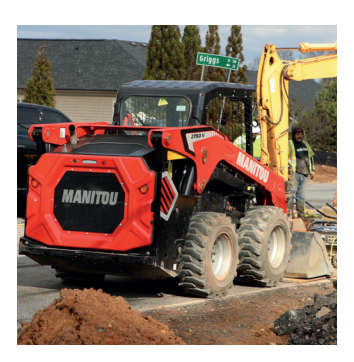
Counterweight A rear bumper counterweight improves productivity and protects the rear of the machine from accidental damage. Optional side counterweights can further increase operational capacity.