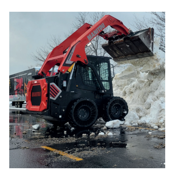
Bucket self-leveling Automatically maintain the bucket position when raising the lift arms.